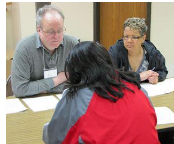
Volunteers at the Aurora clinic walk through a client's paperwork before she meets with the attorney. With one attorney and one paralegal, NIJFON relies on volunteers to experience life-changing welcome with clients.